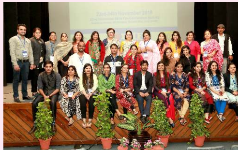
National Conference on the theme - "Every Child's Right to Early Childhood Development : Evolving Inclusive Practices", Nov 2018, New Delhi