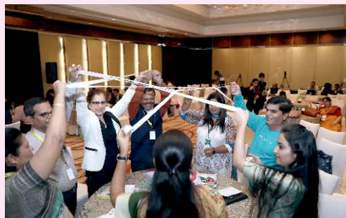
A Conference on "Future Ready Schools: Leadership Role of Principals" in association with NEXT Education, Nov 2019, New Delhi