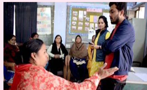
CECED Team conducting Focus Group Discussion in Narela in the month of February 2018, with the community members during the Situational Analysis Phase under the development of ECCE Centres of Delhi Project.

CECED Team with World Bank team, Meghalaya CM, Commissioner and Secretary C&RD and Meghalaya State Rural Livelihood Society CEO- Presenting the outcomes of the Feasibility study on the integrated ECD intervention package and the role of MSRLS in Meghalaya. CM acknowledged the outcomes of community-led ECD pilot and advocated to scale-up the model immediately.