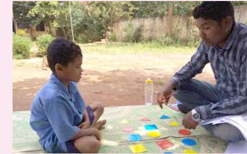
As part of the field investigators training on data collection tools under SAT Project, field investigators are undergoing field trials in Bastar, Chhattisgarh on 3rd October 2018.