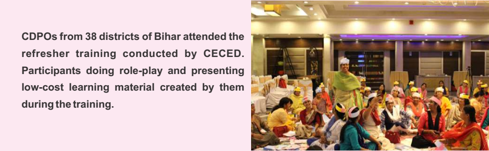
CDPOs from 38 districts of Bihar attended the refresher training conducted by CECED. Participants doing role-play and presenting low-cost learning material created by them during the training.